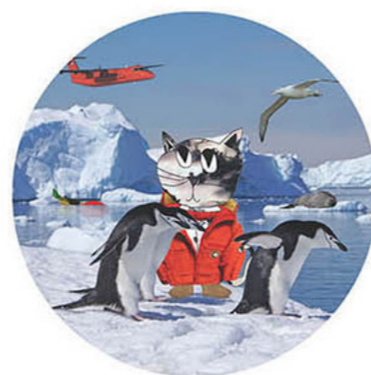
Pole to Pole