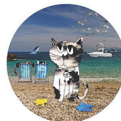
Molly by the Sea