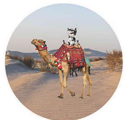
Molly in the Desert