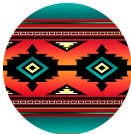
Native American Indians