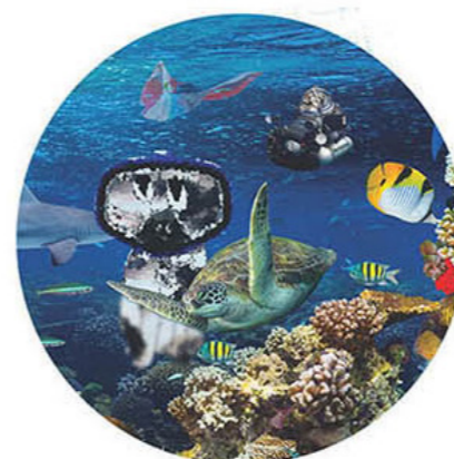
Molly’s Coral Reef